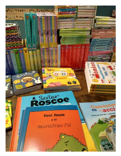
Books from our book drive