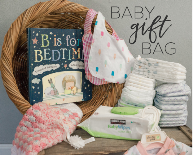
Items from a Baby Gift Bag